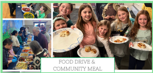
FOOD DRIVE & COMMUNITY MEAL

Congregational Meeting Sunday, Feb. 2 Following 10:30 worship